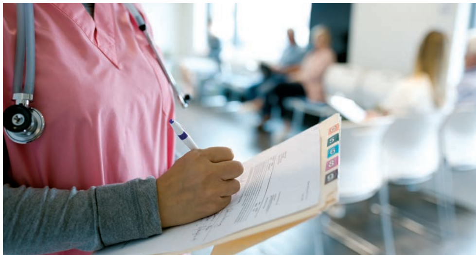
One expert feels that many providers might not be prepared because they have been pulled in too many directions.

Richter is concerned "most educational opportunities have not included change management strategies or project management road maps for providers to put to use" in the