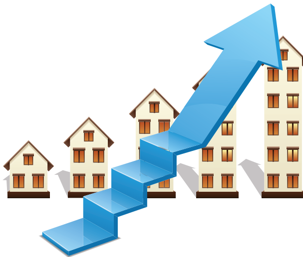
Baby boomers will supply tailwind to demand projections, but investors are cautioned to temper expectations because of possible offsetting factors.

Another difference is that services — transportation, laundry, meals, assistance with activities of daily living, and care — are outsourced, so residents pay